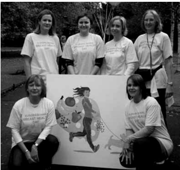
At the walk in Stephen's Green