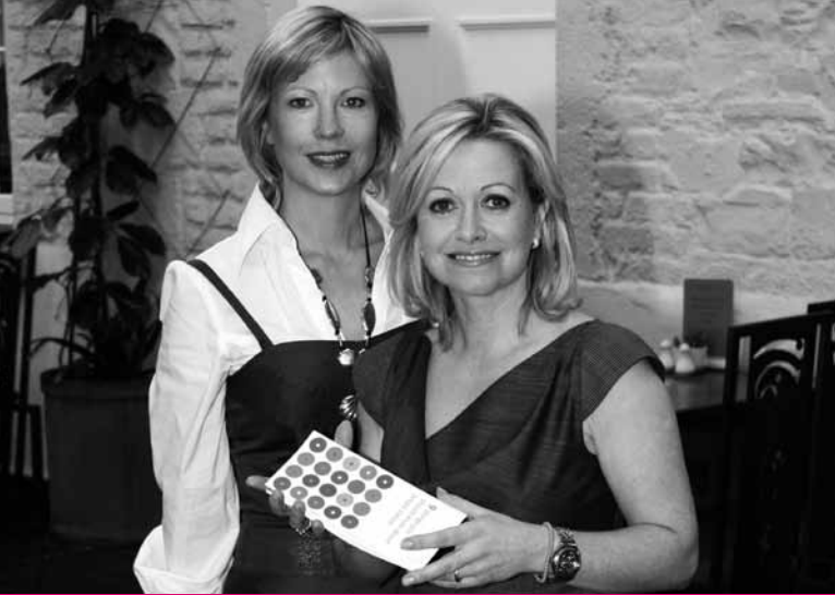
Emma Hannigan and Cathy Kelly