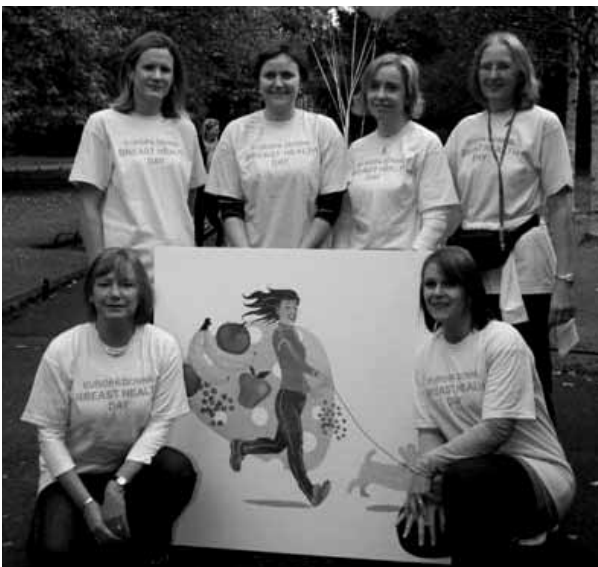
At the walk in Stephen's Green