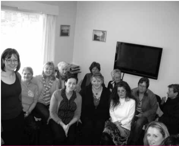
Breast Awareness Group Talk in Donegal