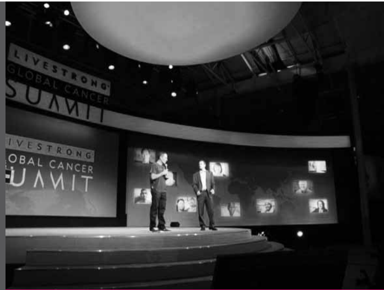
Lance Armstrong at LIVESTRONG