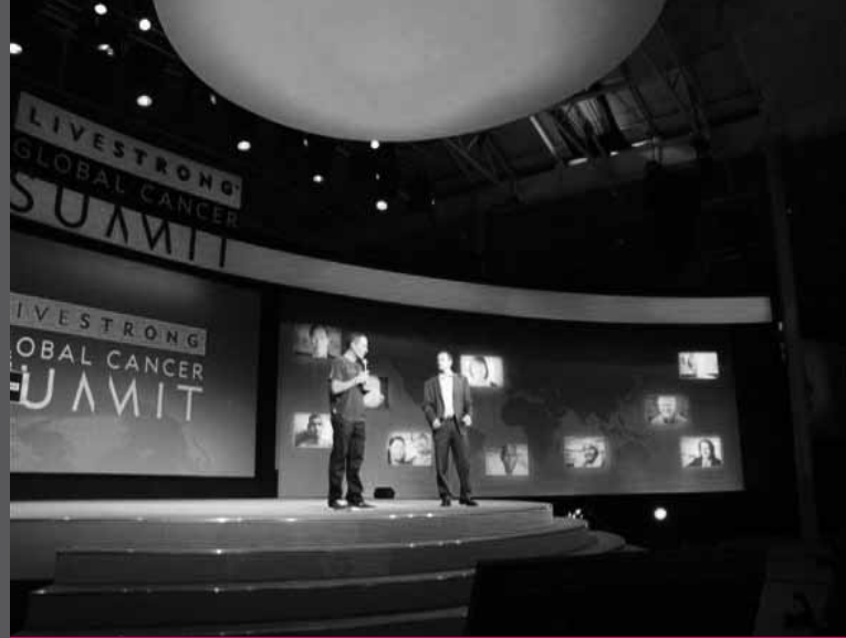
Lance Armstrong at LIVESTRONG