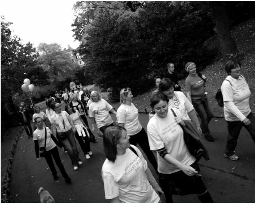
Walk in Stephen's Green - Breast Health Day 2009