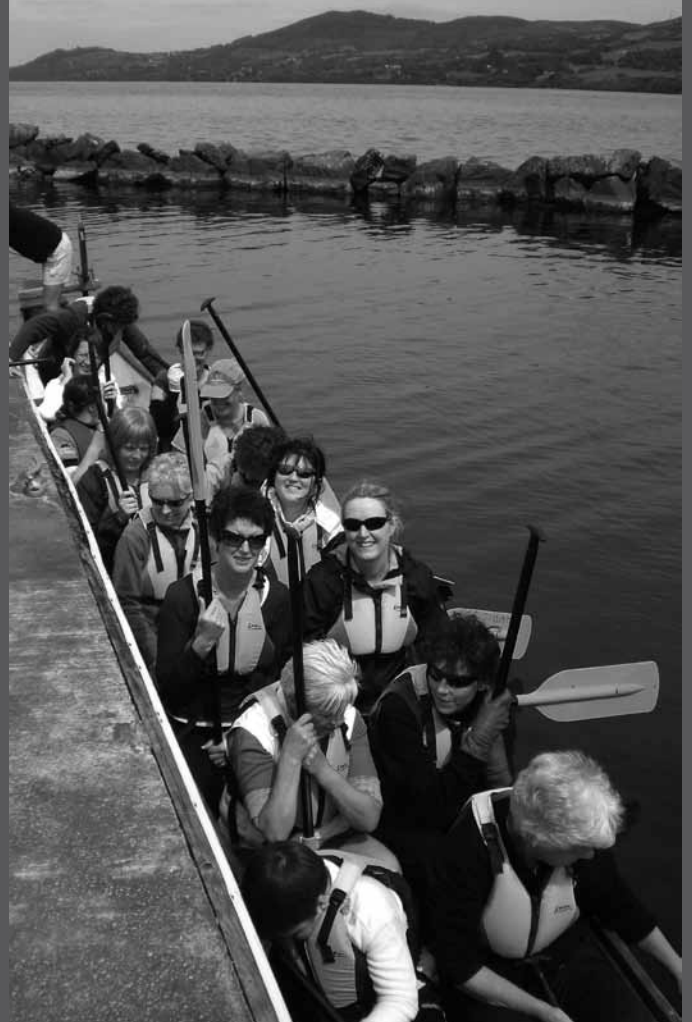
Dragon Boat launch at Killaloe

Not everyone that attended on Saturday could stay for the Sunday training session so the numbers weren't as big and despite the change in the weather, for the worse, we took to the waters again. It was great to get the experience of canoeing in the hot sunshine and having to use lots of sunscreen on Saturday and then on Sunday going out in the rain and choppy waters. Overall it was excellent, exciting canoeing experience!