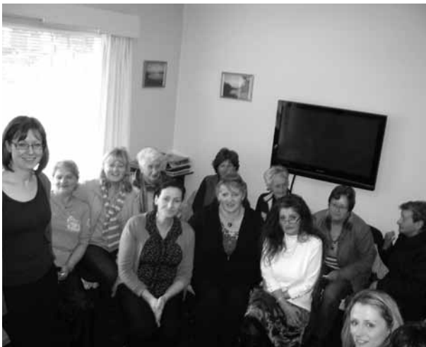
Breast Awareness Group Talk in Donegal