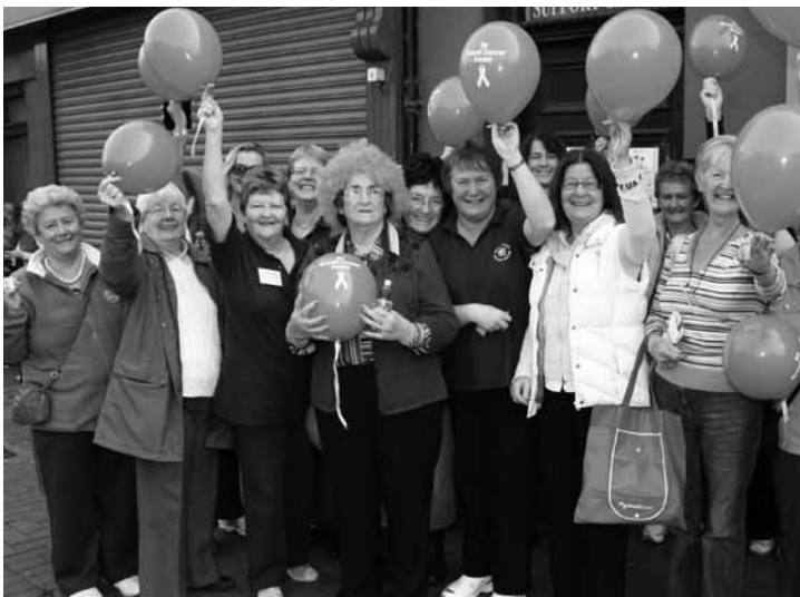
Bray Cancer Support Centre sets out on walk on Breast Health Day 2009