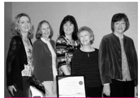
Committee members at the AGM 2010