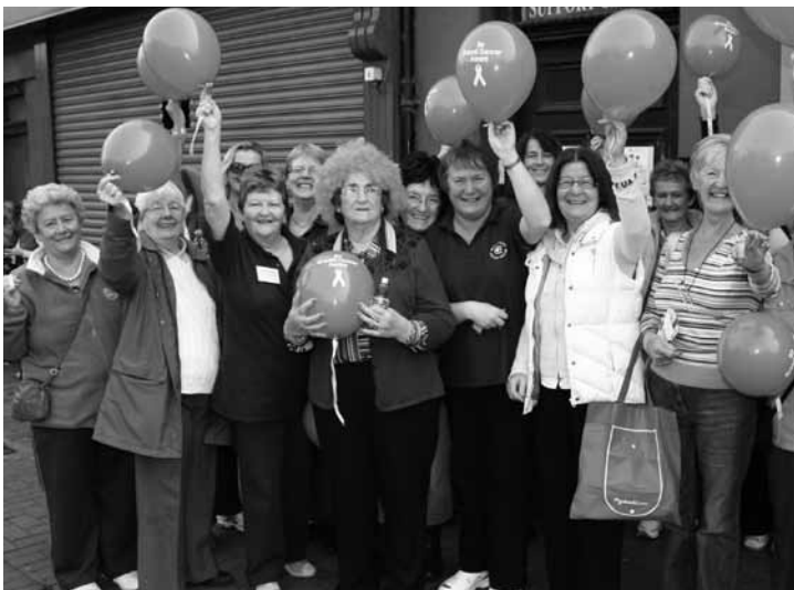
Bray Cancer Support Centre sets out on walk on Breast Health Day 2009