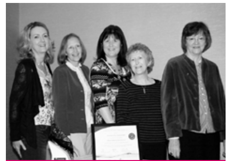
Committee members at the AGM 2010